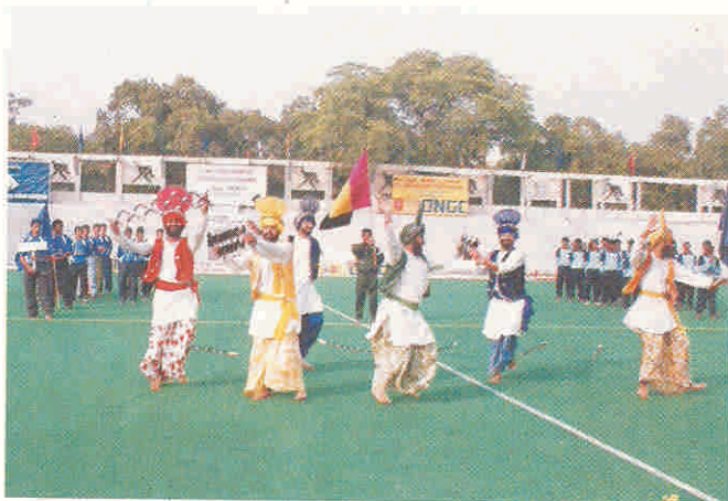
Bhangra by Punjabi Academy celebrating the victory of Punjab Police team at the occasion of 40th ONGC-Nehru Hockey Tournament

Punjab Police went home richer by Rs. 2,50,000/- while Indian Airlines got Rs. 1,50,000/-. Bharat Petroleum beat Tamil Nadu XI to finish third and win Rs. 1,00,000/-.