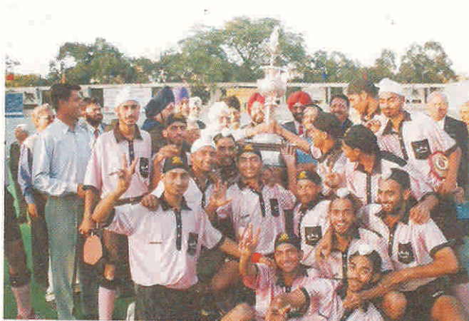
DAV College, Jalandhar Hockey Team with the ONGC-Nehru Champion Colleges Hockey Tournament Trophy

There were cash prizes galore in this SAIL Trophy tournament. The winners got Rs. 96,000/- while the runners received Rs. 64,000/-. The College of Arts and Education (Annamalai) beat Faculty of Humanity (Varanasi) 5-0 to take the third spot and received Rs. 32,000/-.