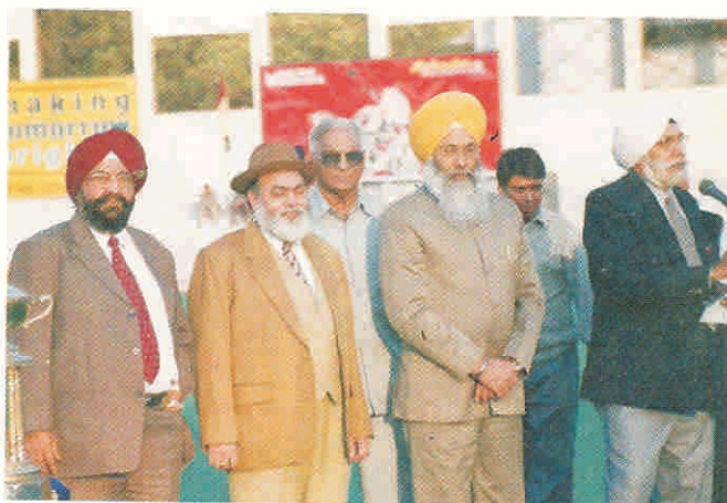
Prize Distribution Ceremony being held on the occasion of 40th ONGC-Nehru Hockey Tournament