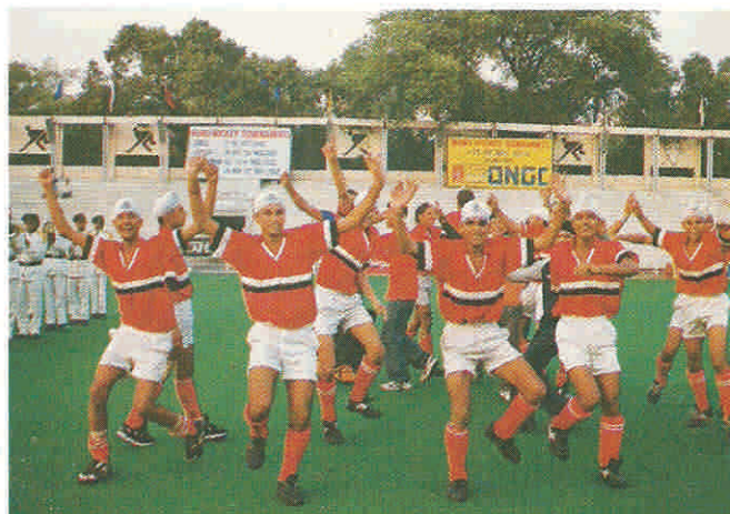
Govt. Model Sr. Sec. School, Jalandhar team celebrating the victory – Finals 20th Nehru-ONGC Sub-Junior Tournament

It was conducted from 1st November to 13th Nov., 2002 and is sponsored by the ONGC with prize money of Rs. 2.30 lacs. A total number of 24 teams participated in the Tournament. Govt. Model Sr. Sec. School, Jalandhar won by beating Lyallpur Khalsa Sr. Sec. School, Jalandhar in the finals.