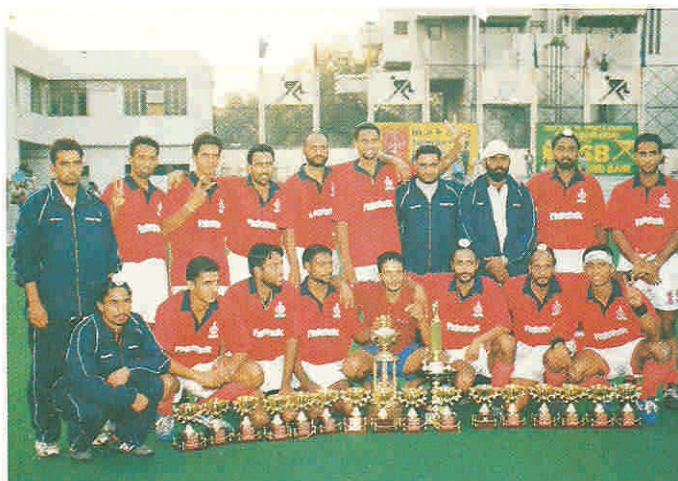
Punjab Police Jalandhar, winners of the Nehru-ONGC Hockey Tournament

39th Nehru-ONGC Hockey Tournament with prize money of Rs. 3.20 lacs was held from 14-25 November, 2002. A total number of 30 teams participated in the tournament. 22 teams were put in four Pools of Six teams each and they played on knock-out basis. The team emerging winners in each group joined eight top teams of the country and they were divided in four groups of three teams each to play on league basis. Punjab Police, Jalandhar beat Indian Airlines in the finals by a golden goal during extra time.