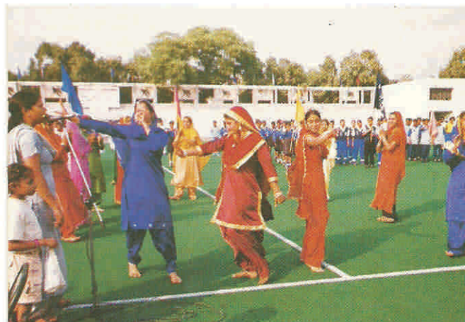
Cultural Programme presented by the members of Punjab Academy – Inauguration 9th Nehru-NDMC Girls Tournament